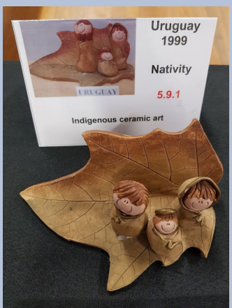
Nativity scenes from around the world at the Nativity Festival