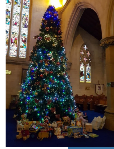
Christmas tree at the Cathedral.

over the Christmas period. They fastidiously sprayed disinfectant everywhere in the Cathedral. Thank you for keeping us safe!