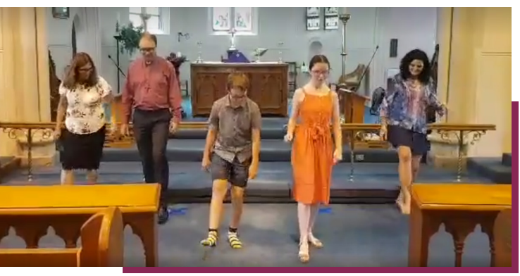
Laughing and joining in the fun of the Jerusalema Dance Challenge at Young Anglican Church. Notice the dance fashion accessories inspired by COVID-19, which are the crosses on the floor and people dancing in family groups.

https://plus.citybibleforum.org/civicrm-event/2437