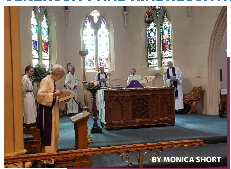
The beautiful St John's Anglican Church, Young.

Could COVID-19 be brightening Christian generosity and kindness, making them more visible? The COVID-19 normal is impacting ministries, and the question 'How is COVID-19 changing Christian generosity and volunteering?' is a recurrent conversation in our diocese. My daily Bible reading is illuminating for me the beauty of Christian generosity, kindness volunteering. Day-to-day acts of generosity, kindness and volunteering are becoming visible to me, in a new way. I'm beginning to perceive actions that I missed noticing before COVID-19.