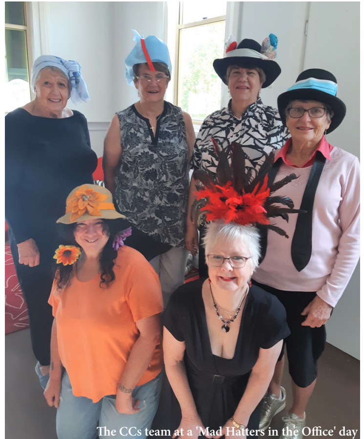
The CCs team at a 'Mad Hatters in the Office' day

Gracious and life-giving Father, we praise you for sending your Son, the true bread from heaven, who gives life to the world; and we give you thanks for the gift of your Holy Spirit, the breath of God, who empowers, equips, and renews; we ask your blessing on the pilot program to revitalise churches in our Diocese. We pray for the parishes of Cootamundra, Bungendore, Arawang, Hackett, Lanyon Valley and Tumut. Give them wisdom and discernment to hear your voice and rise to follow our Lord Jesus Christ, who lives and reigns with you and the Holy Spirit, one God, now and forever. Amen.