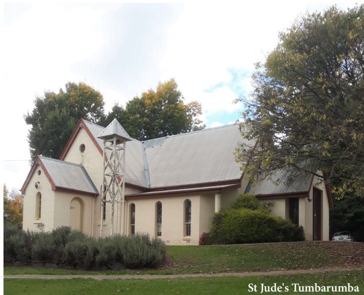
St Jude's Tumberumba