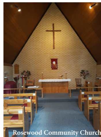
Rosewood Community Church

Rosewood and Tumbarumba have seen a revitalisation since the opening of the Tumbarumba to Rosewood Rail Trail along the route of the long-closed railway line. Thousands of cyclists visit