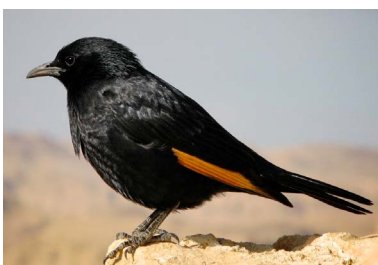
Tristram's Grackle taken at Masada, Israel. In public domain.

In the teaching of Jesus in the Gospels of Matthew and Luke, we have a simple illustration in his reference to the birds of the air. They have nests but the Son of man has nowhere to lay his head.