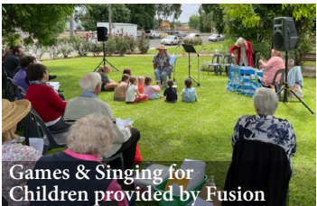
Games & Singing for Children provided by Fusion