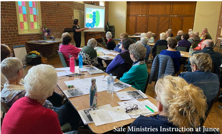
Safe Ministries Instruction at Junee

in Annie's Op Shop (Anglican) and it was a good opportunity for them to learn the goal of safe ministry instruction which aims to keep them and the customers spiritually, emotionally and physically safe. 'Joy' was the theme of the Junee