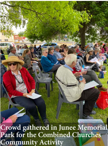
Crowd gathered in Junee Memorial Park for the Combined Churches Community Activity