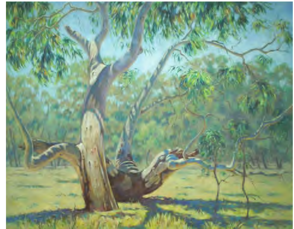
An Ancient in Nyah Forest Hans Heysen