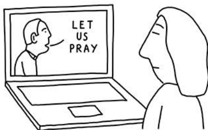
A BIT OF SHUT-EYE