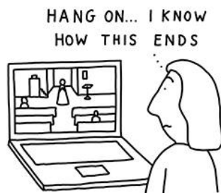
THE REALISATION THAT THIS WAS LAST WEEK'S EPISODE