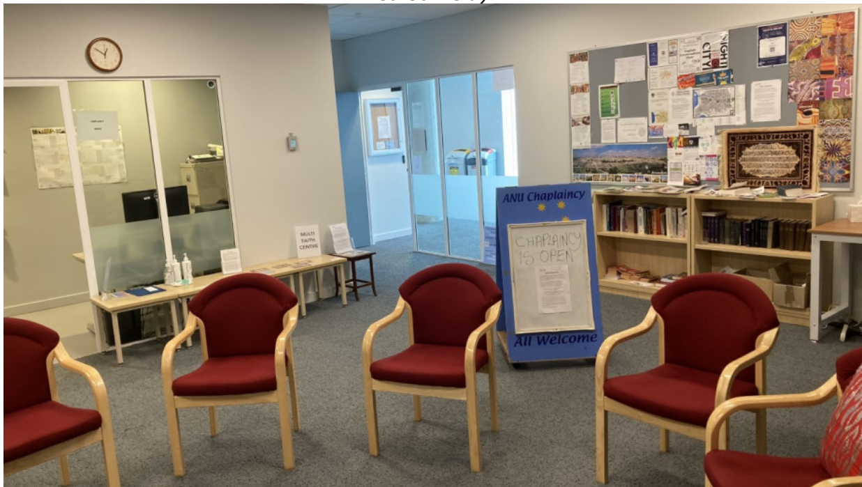
ANU Chaplaincy, 4 th Floor, Di Riddell Building

April is a significant month for various faiths, and at ANU, we recognize the importance of spiritual support for all members of our community. That's why we have the ANU multi-faith Chaplaincy , which provides a safe and inclusive space for students, staff, and visitors to practice their faith or explore their spirituality. With a multifaith and Muslim prayer room, individuals from any belief system are welcome to join this community. From pastoral care to spiritual guidance and activities related to faith and religion, the Chaplaincy offers valuable resources for all ANU members.