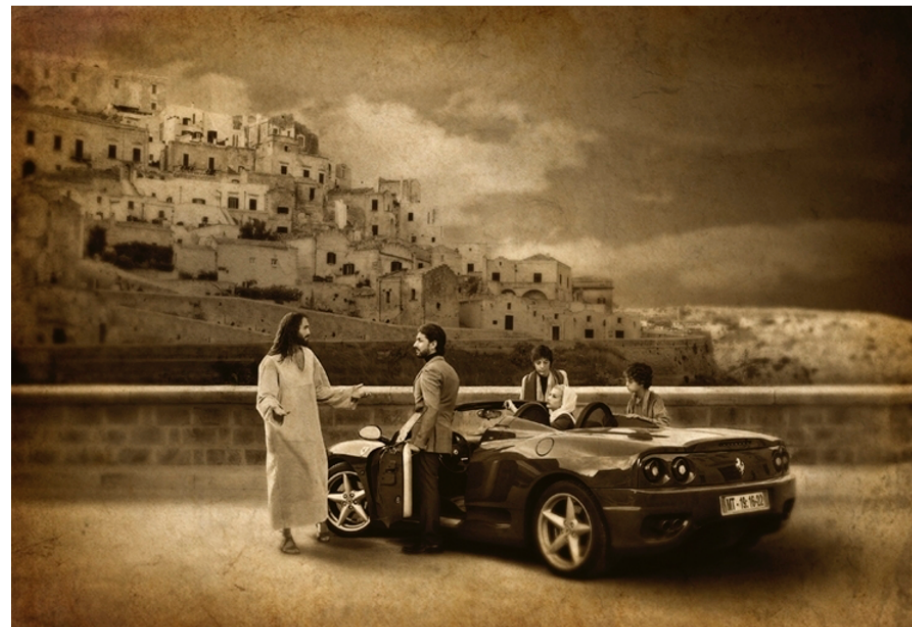
The Rich Young Ruler.

We acknowledge the Ngambri and Ngunawal people, the traditional custodians of the land on which we worship. We pay our respects to their elders, past, present, and emerging. We extend that respect to Aboriginal and Torres Strait Islander peoples who worship with us.